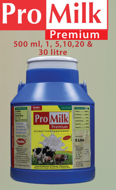
Six times stronger Calcium tonic with Magnesium

Cattle, Buffalo: 20-50 ml Calf : 10-20 ml Sheep & Goat : 10 ml daily Dog & Small Animals:10 ml daily Broiler/Layer: 20 ml-100 birds twice daily Chicks: 20 ml-1000 chicks twice daily Growers: 20 ml-200 growers twice daily